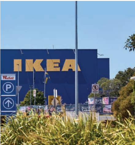
Just 20 minutes to major retail hubs