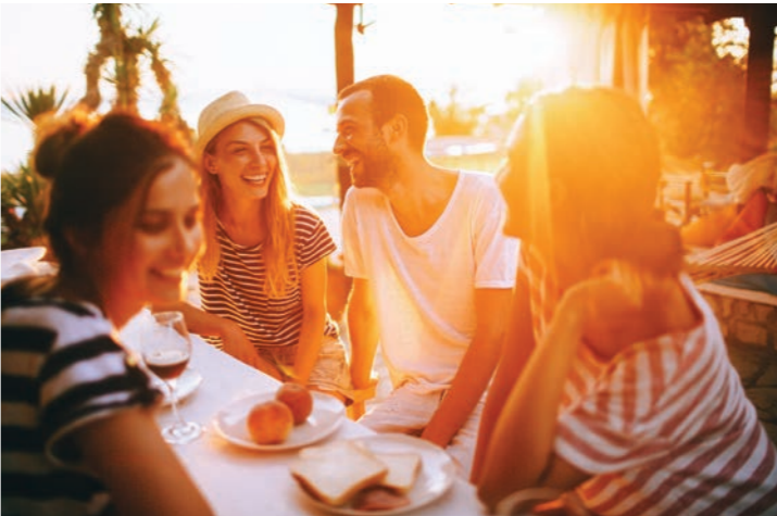
Catch up with friends at one of the many restaurants on your doorstep