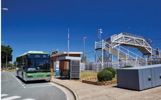
Easy access to public transport