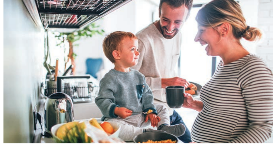
Enjoy slow mornings in your family home