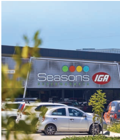
Local shops and amenity just moments away