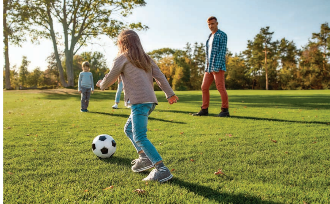
Spend quality family time enjoying the community park