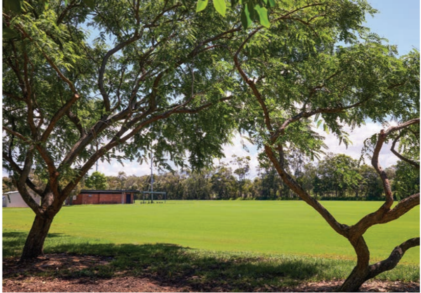
Take a bike ride to one of the many parks nearby