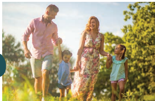
A place to grow and live naturally