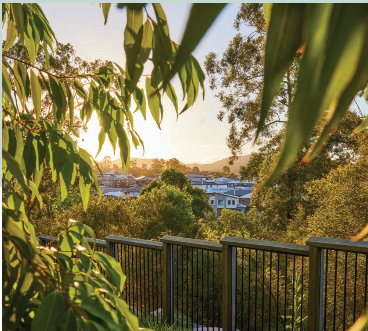
Cedar Woods Properties: Ellendale, QLD