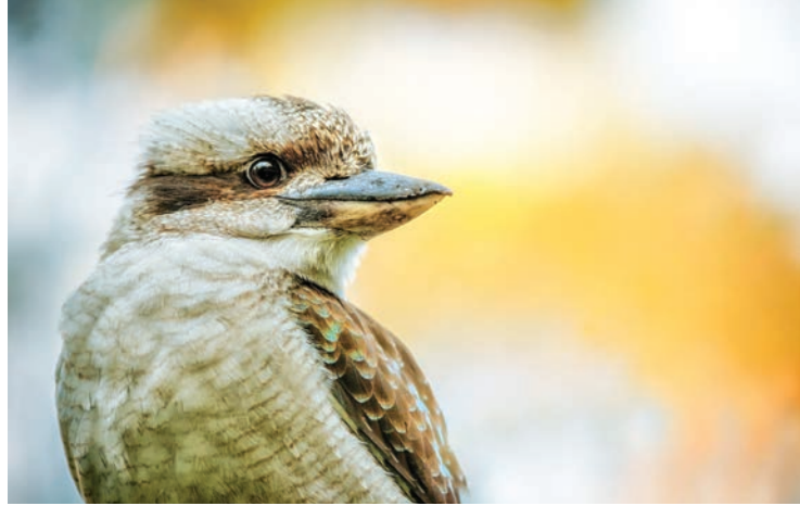
Embrace Sage's natural surroundings