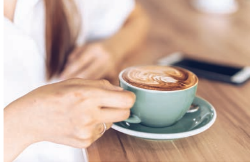
Enjoy coffee at local hotspots