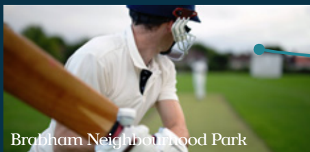
Brabham Neighbourhood Park