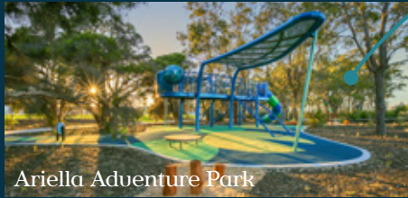
Ariella Adventure Park