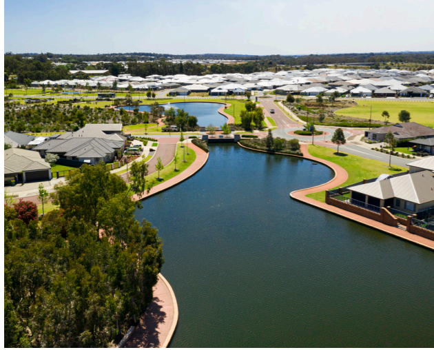
The Rivergums, Baldivis WA