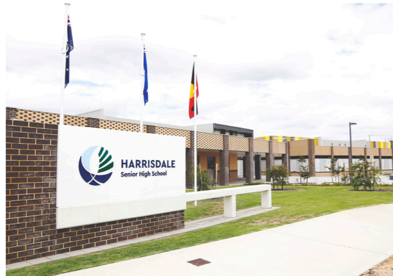
Harrisdale Senior High School