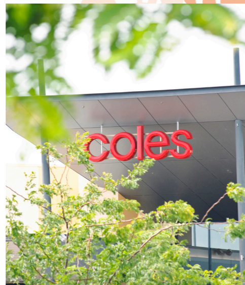
Coles Southern River Shopping Centre

It's an established and vibrant place where the community is alive and everything you need is close by. It's a place that you need to see to believe, and one that you won't want to leave without knowing how you can be part of it too.