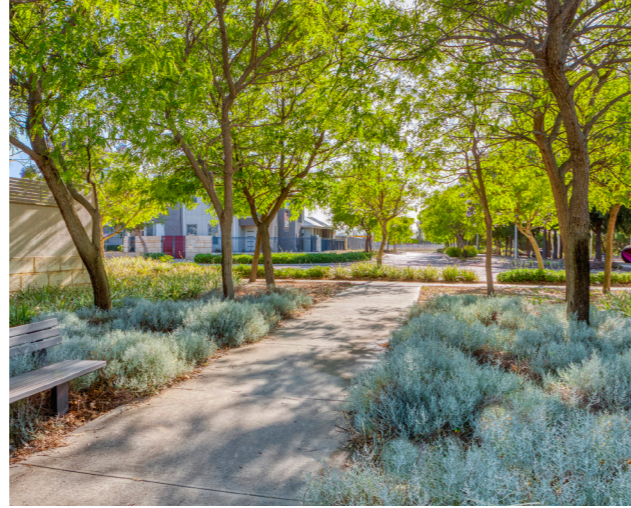
Harrisdale Green, Harrisdale WA